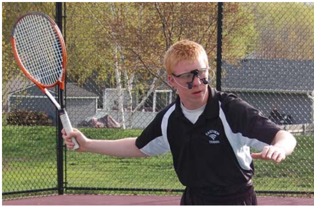
Glasses-Type Head Unit

NAC Image Technology introduces the EMR-9, the latest development in eye tracking measurement and analysis systems. The EMR-9 is a truly mobile system that offers significant reduction in size and weight over traditional eye measurement systems. This allows the subject to move freely and unencumbered in their natural environment. The EMR-9 records data to a compact SD memory card. This SD memory card can then transfer the data to a PC where detailed statistical analysis can occur using EMR-dFactory, our optional software analysis package. Finally, the EMR-9 offers detection and sampling rates up to 240 Hz, ideal for active and mobile participants.